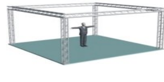
20x20 Truss System

The exhibitor is responsible for hardware (Console/PC, Peripherals) and software for kiosk. Additionally, exhibitor is responsible for any upgraded carpeting, additional electricity, staffing and any additional booth decorations (and all related shipping, drayage, warehousing, installation, removal of materials provided by exhibitor).