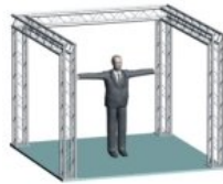
10x10 Truss System